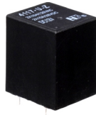
Wash tight 17.5×15×20